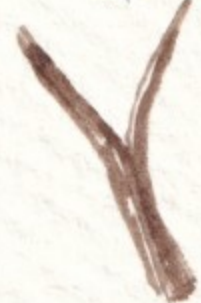
A stick shaped like a letter of the alphabet