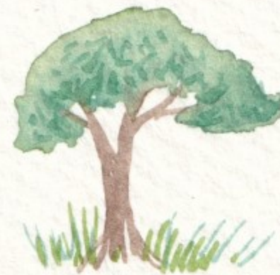
An evergreen tree