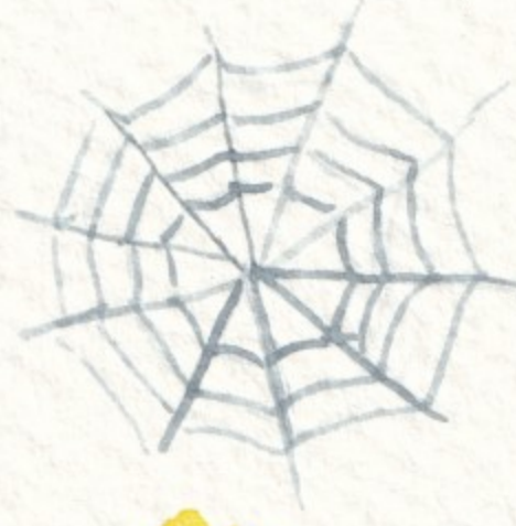
A spider web