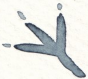
A track or footprint