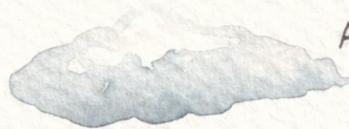
A funny shaped cloud