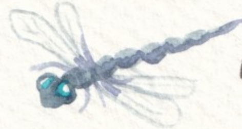
A flying insect