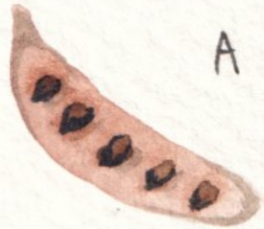
A seed or seed pod