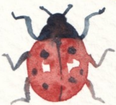
A bug or insect