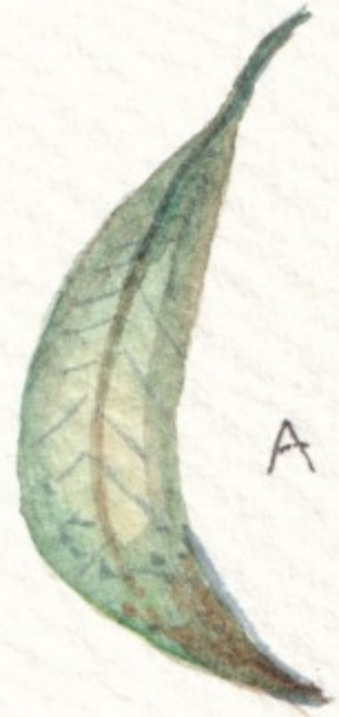
A curved leaf